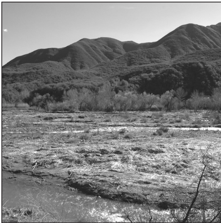
AFTER: Habitat areas in the upper Ventura River on their way to recovery after giant reed removal.